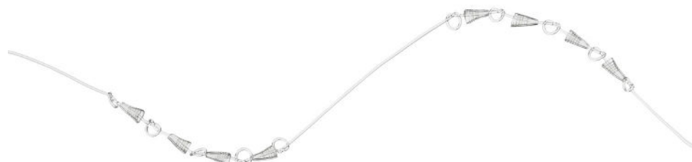
FIGURE 1. The InstaLift™ absorbable suspension suture. The suture is comprised of 8 bidirectional cones to support elevated tissue in a fixed position.

In July 2017, the authors of this manuscript published a consensus paper on the safety and efficacy of absorbable suspension sutures. Since the time when the first consensus manuscript was originally submitted (January 2017), the collective clinical experience of the authors with this technology has continued to grow, and ongoing communication within the group led to